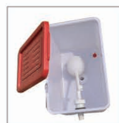
Depressurization Type Water Tank With automatic feed water system, labor saving