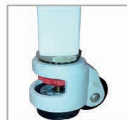
Footmaster Caster Universal caster with brake and leveling feet, easy to move and fix