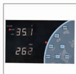
LED Display Temperature and humidity, with fan, UV lamp, fluorescent lamp, heating lamp control buttons.